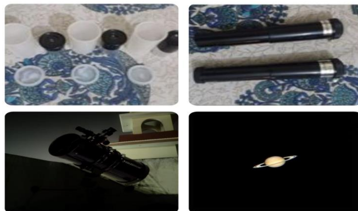
Figure-4 Celestial Astromaster 130EQ Telescope Components used to gather Saturn's data.

For closer examination, a 4mm eyepiece and a barlow lens were employed to increase the magnification to an impressive 1000x. This arrangement facilitated a more detailed analysis of Saturn's complex features, offering a closer look at ring dynamics, atmosphere processes, and moon interactions. The observation sessions, lasting one to two hours each day, were carried out diligently. Over the six-year period, this prolonged and frequent observation ensured the recording of numerous oppositions and notable shifts in Saturn's ring positions. Long-term monitoring proved essential to identify minute changes and periodic trends in Saturn's activity. An advanced Nikon camera was integrated into the observational setup to complement ocular observations made through the telescope. This two-pronged method, combining telescope viewing and Nikon camera photography, generated a large dataset for the subsequent examination of oppositions, ring dynamics, and moon activity (see Fig. 4) [1-4].