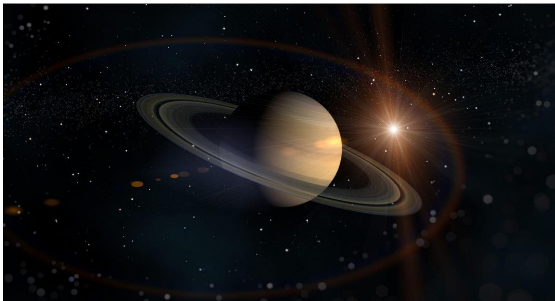
Figure-1 Image of Planet Saturn