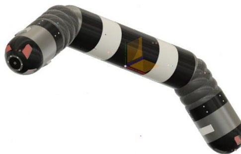
Figure 1 Design of Europa's Autonomous Underwater Vehicle (AUV)

The figure 2 depicts the typical design of a European Autonomous Underwater Vehicle which is made of Aluminum metal with two-three layers of protective coating for protection from thermal imbalance and surface radiation. The bot is battery-powered and equipped with fundamental sensors such as a gyroscope sensor, Doppler velocity sensor, altimeter, and pressure sensor. In addition to that, we have planned to mount spectrometers (for life detection and analysis) and environmental sensors (for analyzing the environment, temperature, and pressure) for gathering data on the subsurface environment. Further, the bot movement is powered by four thrusters (one at the end of the bot) followed by other components such as ESC, an AI System (for real-time decision and data transmission), and a camera of subsurface imaging [8-10].